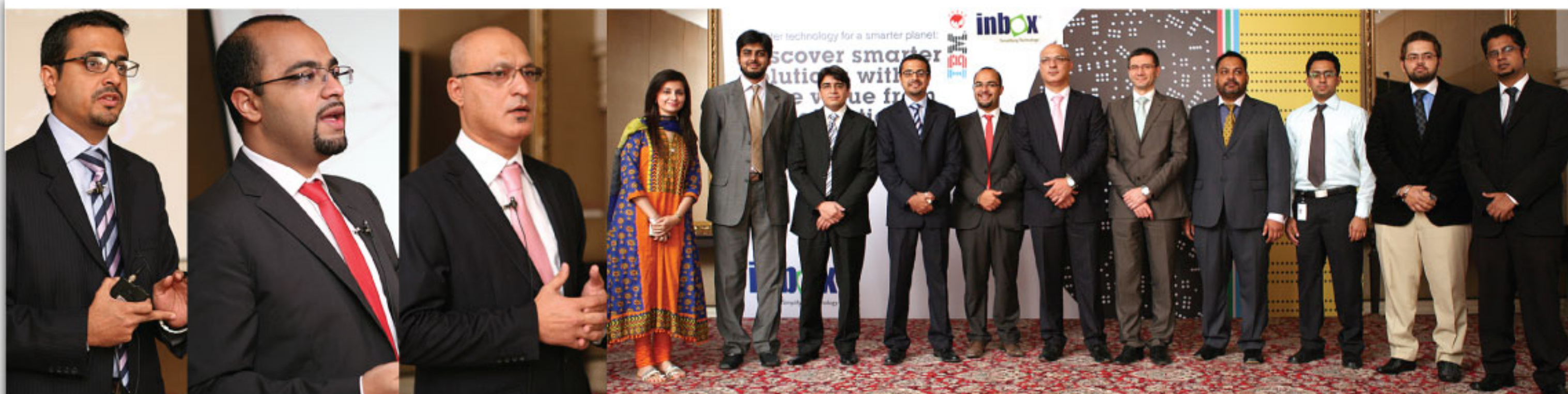
Inbox and IBM teams at Discover smarter solutions with more value from virtualization

IBM Pakistan and Inbox Business Technologies jointly introduced IBM Storwize RAS, which will help businesses manage their applications and information explosions effectively and thus increase their storage utilization, storage administrator productivity, application performance and availability.