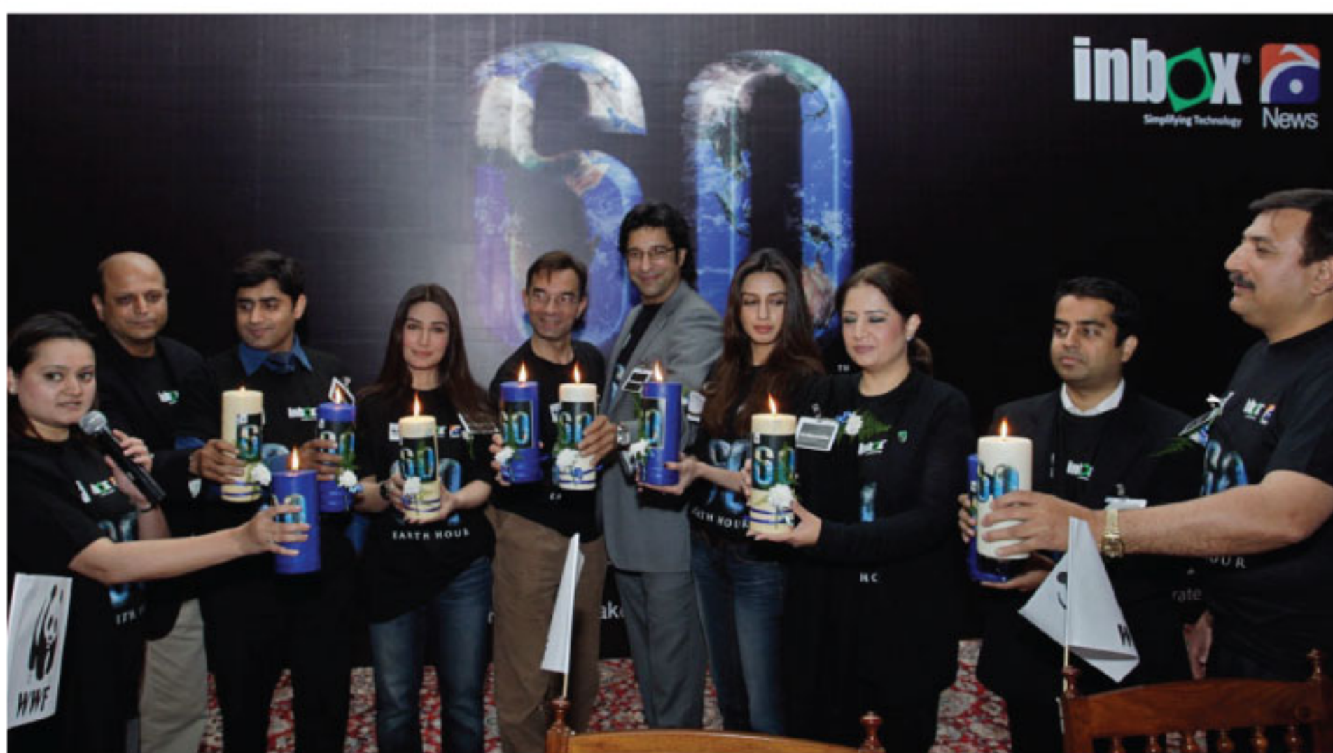
Earth Hour Brand Ambassadors at the launch event

The aim of Earth Hour is to make us think about what else we can do to make a difference when the lights turn back on. For the first time in the history of Pakistan, Inbox in collaboration with WWF-Pakistan, launched the Earth Hour official Ambassadors in Karachi.