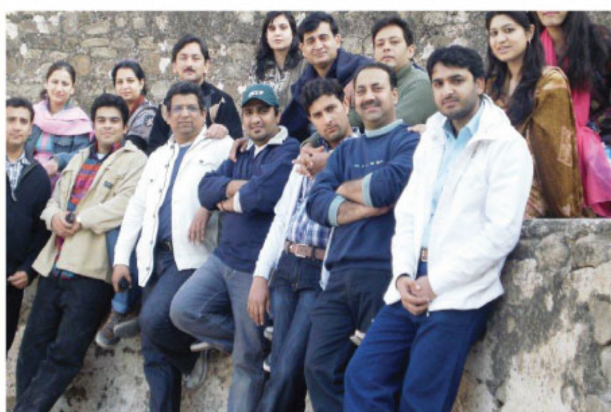
Inbox Lahore branch, at Qila Rohtas