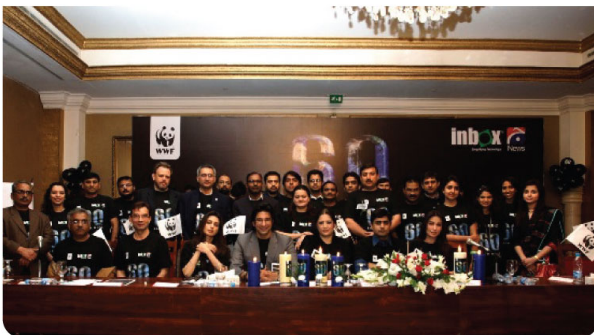
Inbox, WWF and Geo Team at the Earth Hour launch event